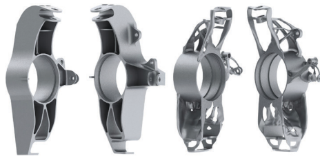
Figure 2: Sample part redesign of an upright of the formula student series

Potential cost reduction opportunities for the future have been identified based on different sample parts. The process was continuously enhanced by further lifecycle processes as usage and others. An exemplary metal component (see figure 2) has been redesigned to reduce weight through efficient structure design and to compare the costing structure and part performance to traditional manufacturing. Furthermore the influence of the designer on the part costs has been investigated.