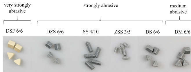
Figure 2: Ceramic finishing media

lyzed by changing the finishing time, velocity and media. For mass finishing processes many finishing media with different sizes and material grade are available. Ceramic media show promising results for a post treatment of Ultem*9085 parts. Figure 2 shows an overview of some ceramic media, which were analyzed regarding their finishing efficiency.