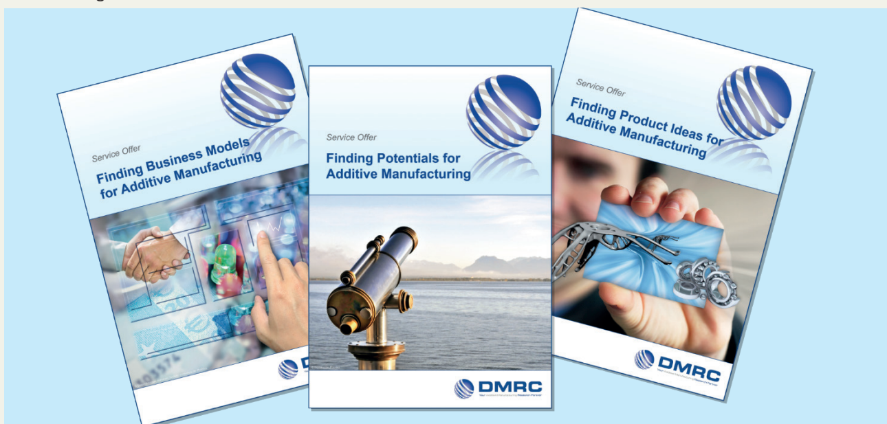
Figure 2: Service Offers of the DMRC in the three addressed competence fields

Eventually, DynAMiCS is a step towards our strategy – being an Industrial Research Base. As one of the many steps towards our vision, we transform our competences to service offers and place them on the market. Figure 2 shows the covers of the three service offers which have been developed in DynAMiCS.