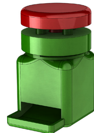
FIGURE 3 Food dispenser